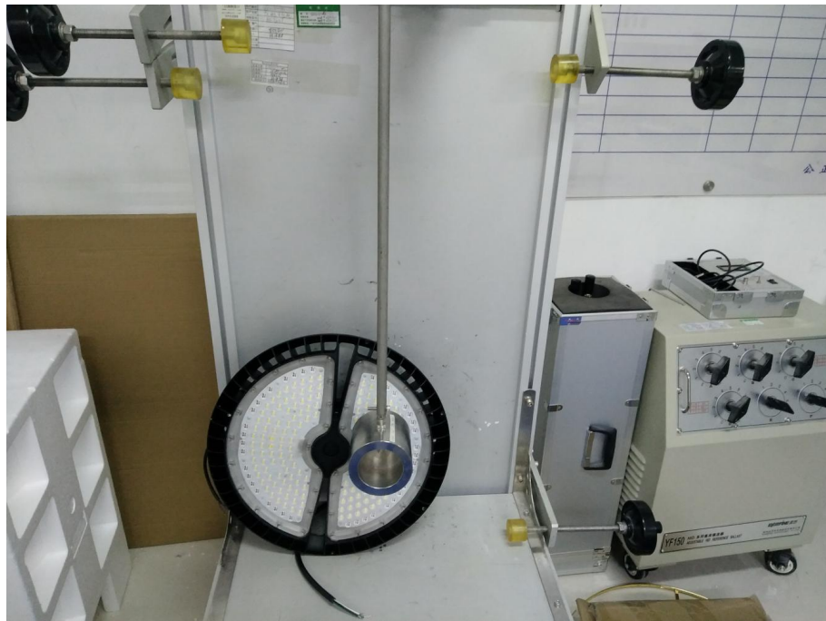
Figure 2 Test photo